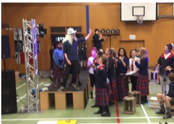
Transforming the school gymnasium, into the Sunset Strip, Los Angeles in the 1980s, complete with live band.